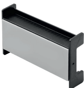
Self-adhesive tape mounting